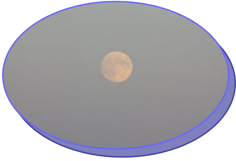
Full Moon Again!!